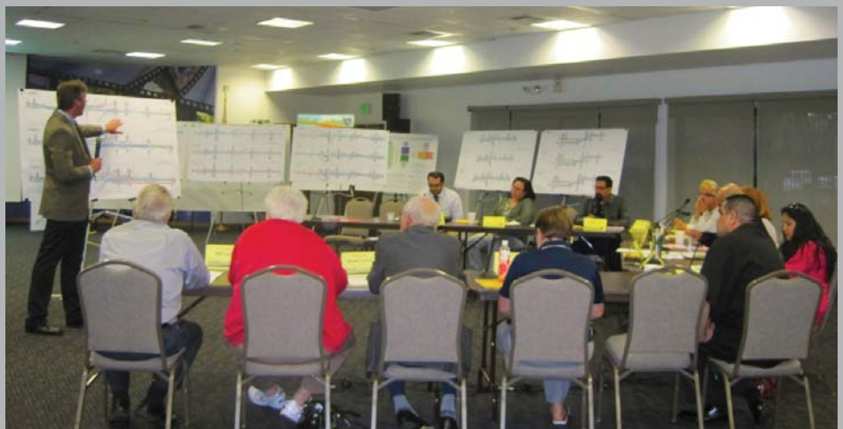
Engineers present refined conceptual geometrics to CAC at March meeting.

Now with a more refined assessment of future traffic conditions along the I-710, the Project Team has been working with the TAC, CAC, LACs, agency and city representatives, and other corridor stakeholders to review the design concepts for the project alternatives that should be included in the re-circulated environmental document.