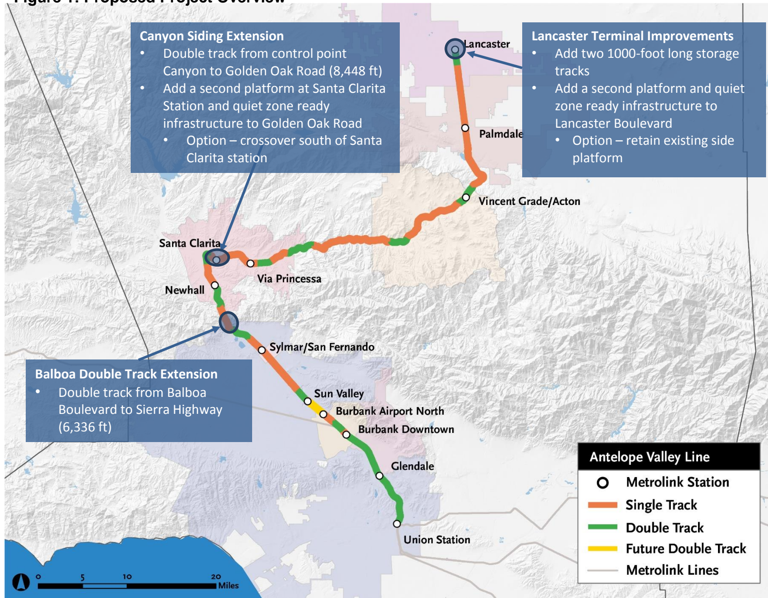
Figure 1: Proposed Project Overview