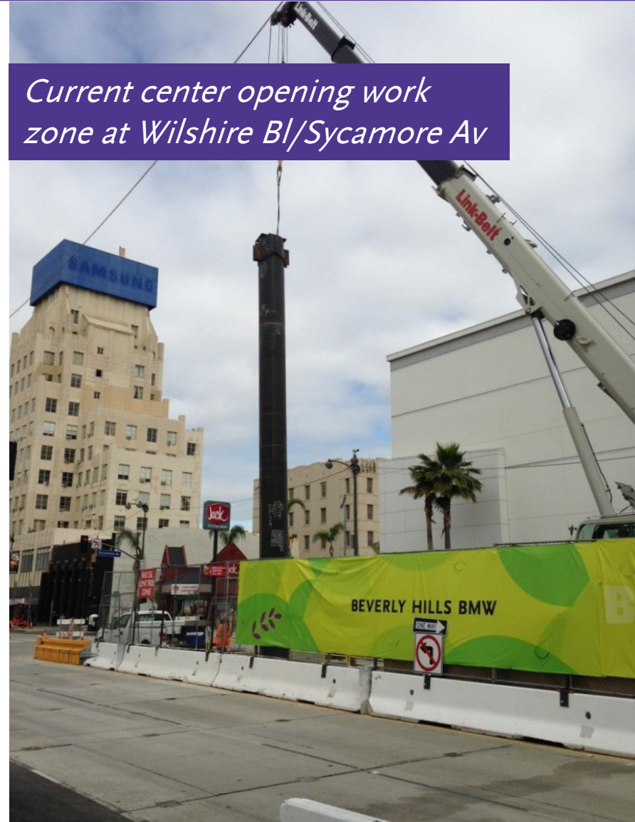
Current center opening work zone at Wilshire Bl/Sycamore Av