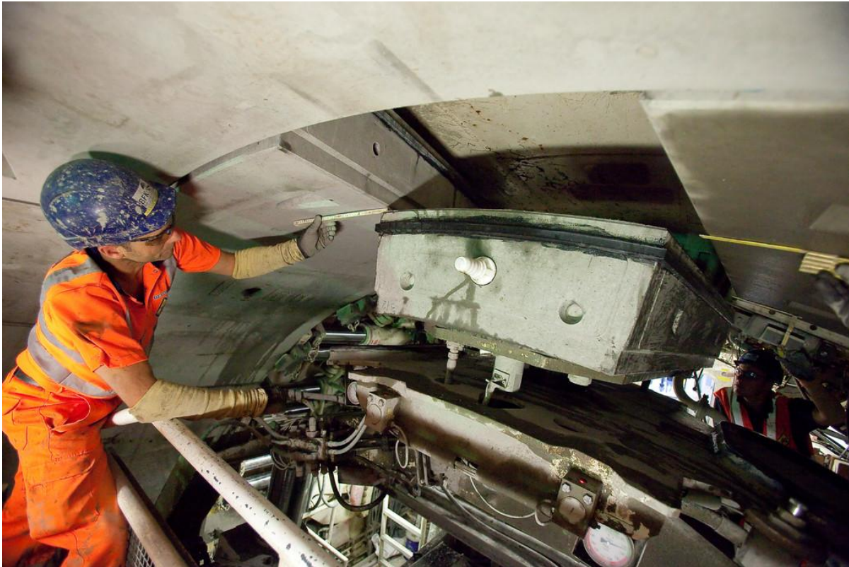
Example of a TBM setting concrete tunnel segments from the Crossrail Project in London, England.

Making this process more amazing is the number of tunnel segments required to complete the almost eight miles traveled by the twin tunnels in Section 1. Approximately 35,000 concrete tunnel segments will be pressed into action by the TBMs.