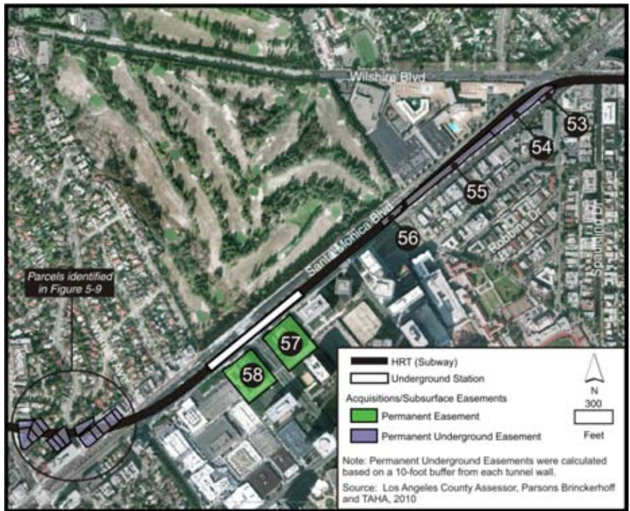
Figure 5-8: Alternative 1 Potentially Displaced Parcels – Century City Station (Santa Monica Boulevard) Area