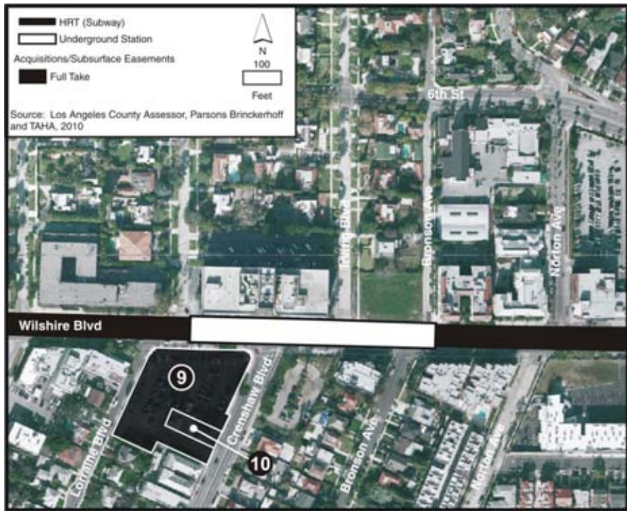
Figure 5-2: Alternative 1 Potentially Displaced Parcels – Wilshire/Crenshaw Station Area