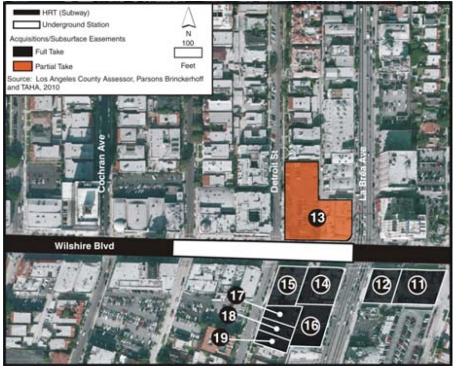
Figure 5-3: Alternative 1 Potentially Displaced Parcels— Wilshire/La Brea Station Area