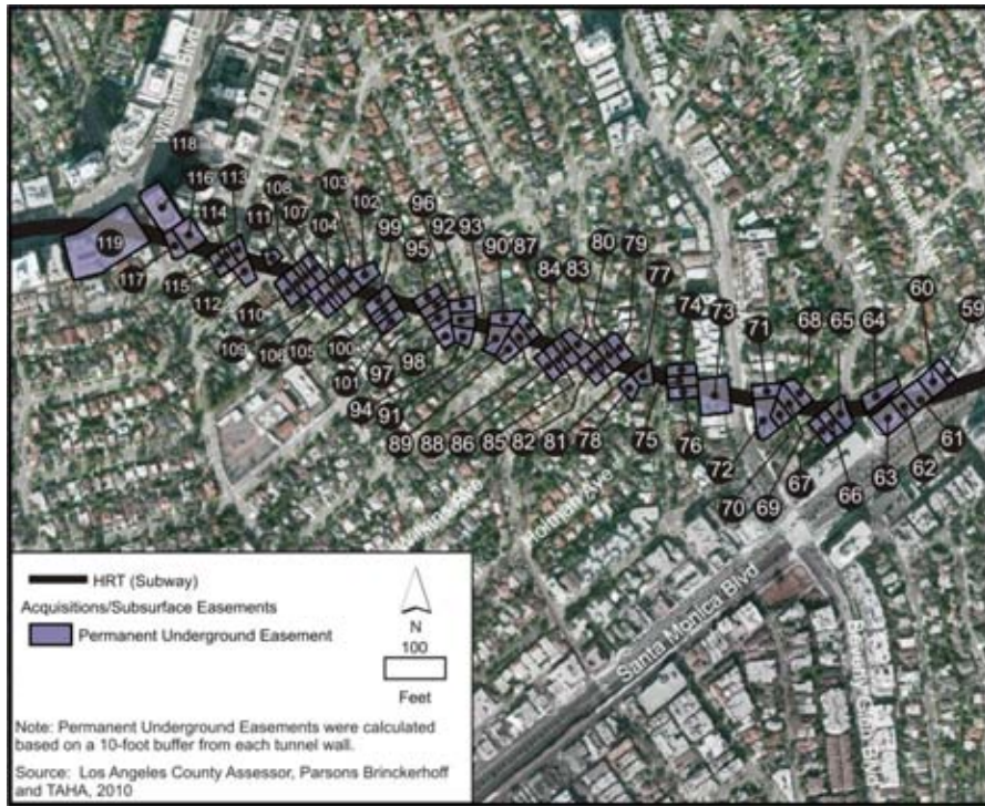
Figure 5-9: Alternative 1 Permanent Underground Easements – Century City to the Westwood Base Route