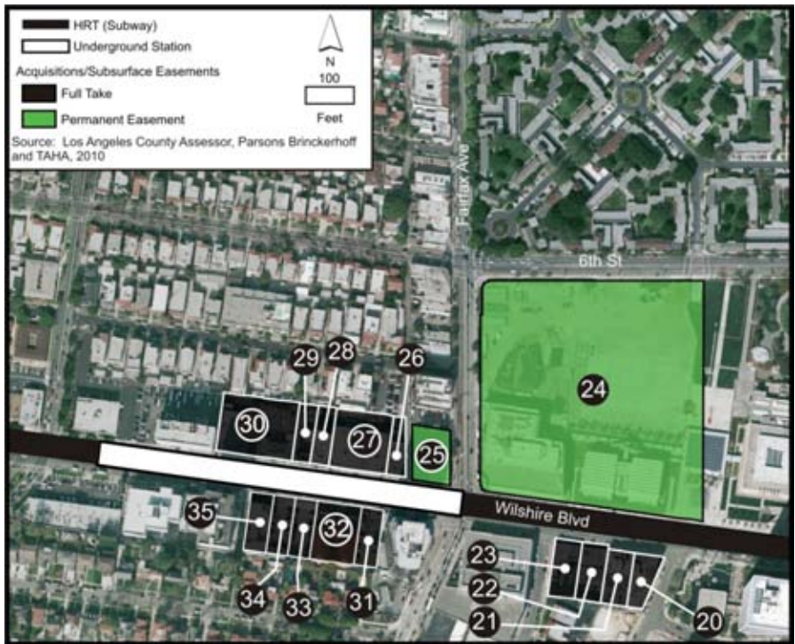
Figure 5-4: Alternative 1 Potentially Displaced Parcels— Wilshire/Fairfax Station Area