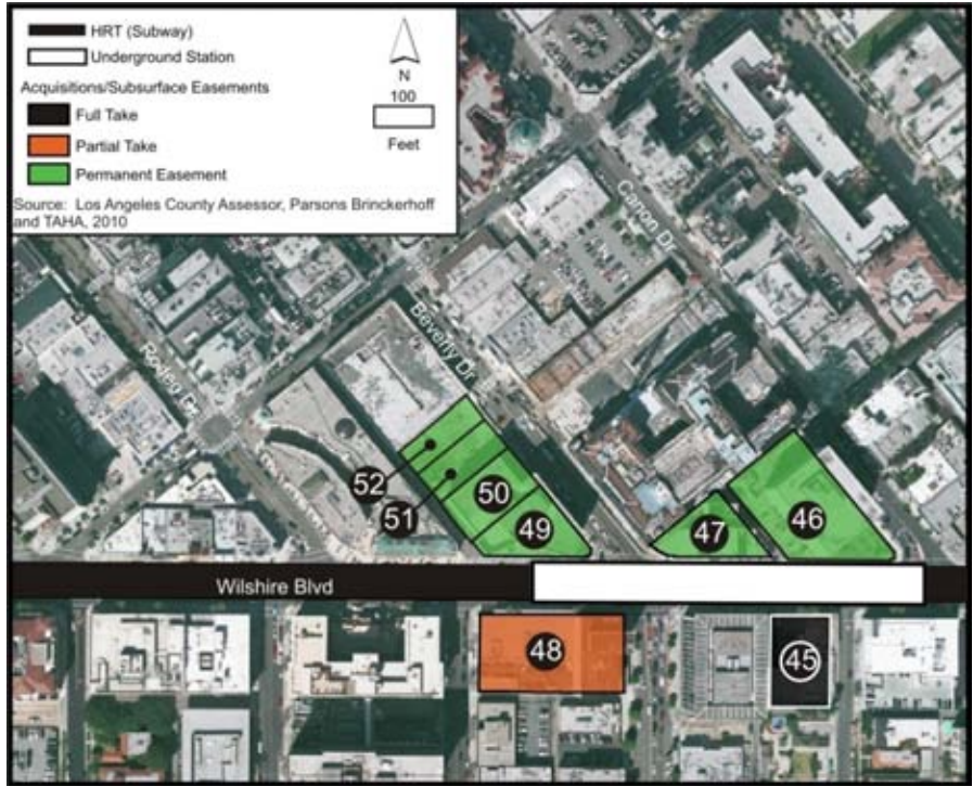
Figure 5-7: Alternative 1 Potentially Displaced Parcels—Wilshire/Rodeo Station Area