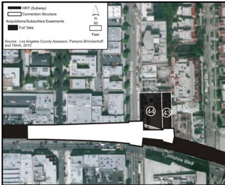
Figure 5-6: Alternative 1 Potentially Displaced Parcels— Wilshire/Robertson Connection