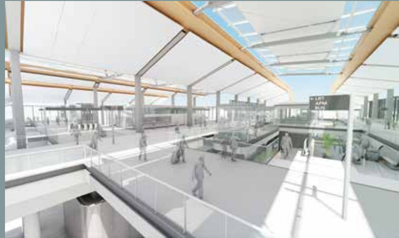
Metro Hub: Mezzanine Level