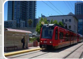
San Diego LRT