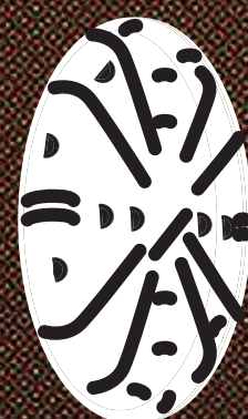
BERTHA CUTTER HEAD

What is a Tunnel Boring Machine (TBM)? A TBM is like a giant drill. The TBM will slowly drill through the earth, digging the tunnels needed for the trains to travel underground. The tunnels will connect three stations from Expo/Crenshaw to Leimert Park.