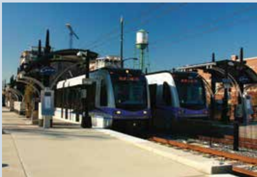
Charlotte Light Rail in Charlotte, North Carolina

Together, Walsh/Shea has completed numerous projects in Atlanta and Chicago. Walsh and Shea have specialties that have contributed to their success respectively. In essence, the companies complement one another, with Walsh's expertise in light and heavy rail and bridge construction and Shea's in tunneling. Each has had its share of sizeable projects. Walsh recently completed the $975 million DART Light Rail System in Dallas, TX. Currently, Shea is working to wrap up construction on the $1.1 billion Metro Transportation Authority No. 7 Subway Line Extension in New York, NY.