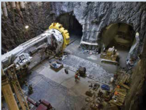
J.F. Tunneling Activity for New York's 2nd Avenue Project