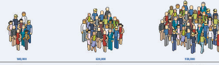
America Fast Forward: Creating Jobs The Right Way (ESTIMATED JOBS FROM TIFIA THROUGH 2015)