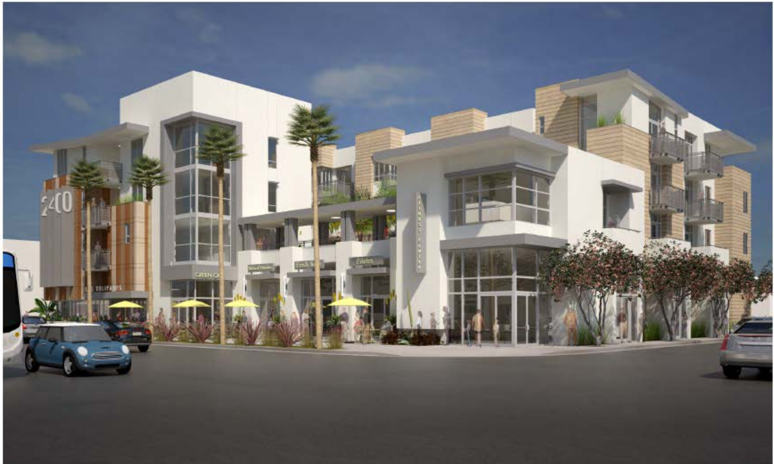
VIEW OF BUILDING FROM NORTH / WEST

SOTO STATION JOINT DEVELOPMENT LOS TULIPANES AFFORDABLE SENIOR HOUSING/ MIXED-USE