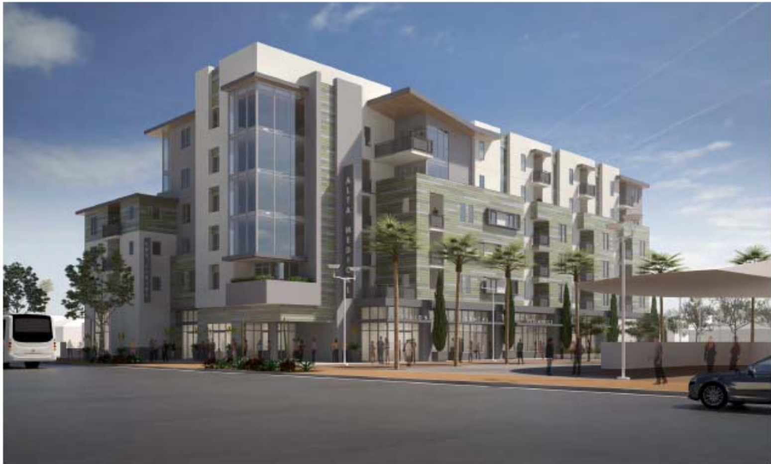
VIEW OF BUILDING FROM NORTH / EAST

SOTO STATION JOINT DEVELOPMENT LAS MARIPOSAS AFFORDABLE FAMILY HOUSING/ MIXED-USE