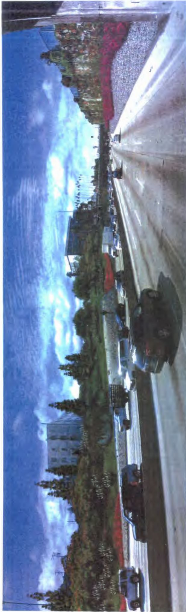
I-110 ADAMS SHOWCASE LANDSCAPE