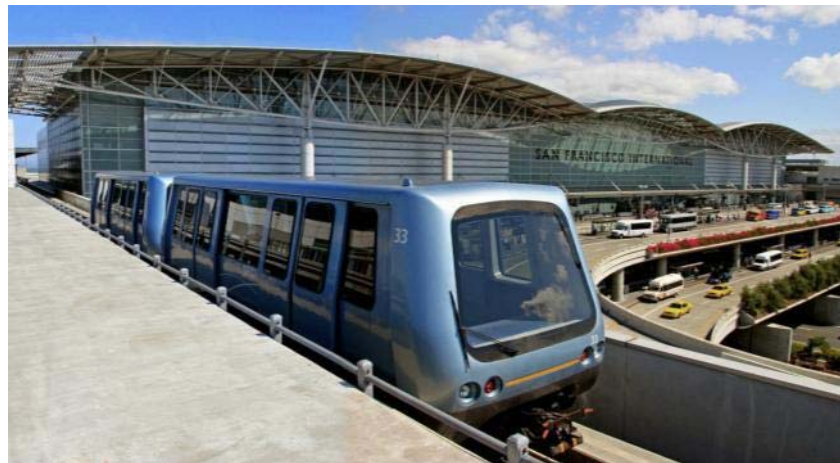
◀ Automated People Mover (APM)