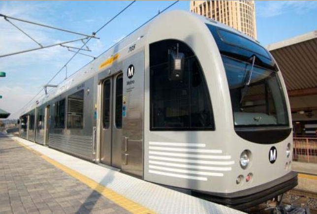
◀ Light Rail Transit (LRT)