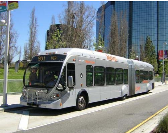
◀ Bus Rapid Transit (BRT) (Elevated Busway)