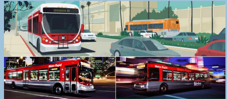
Branding & Image