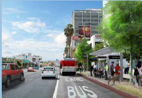
Stations & Platforms