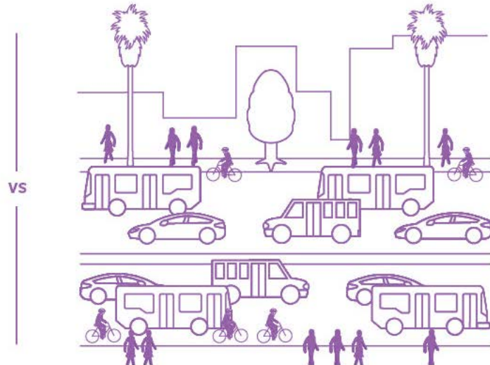
Many more people moving smoothly when we make better use of street space